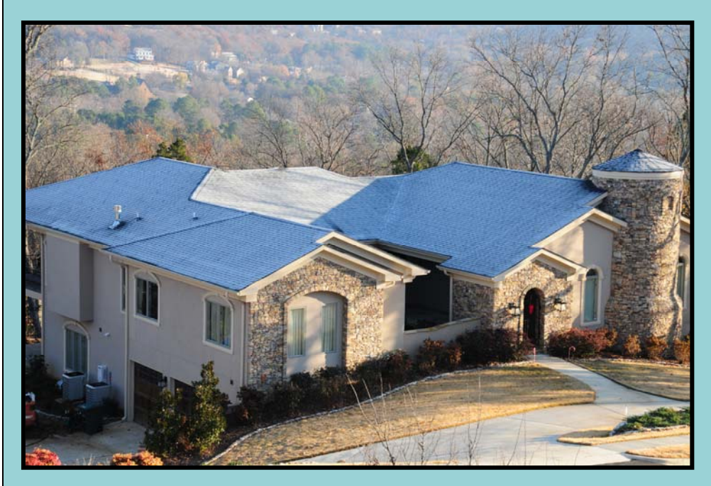
Mailapur's house on a frigid winter morning with frost on the roof..... in spite of the early morning sun