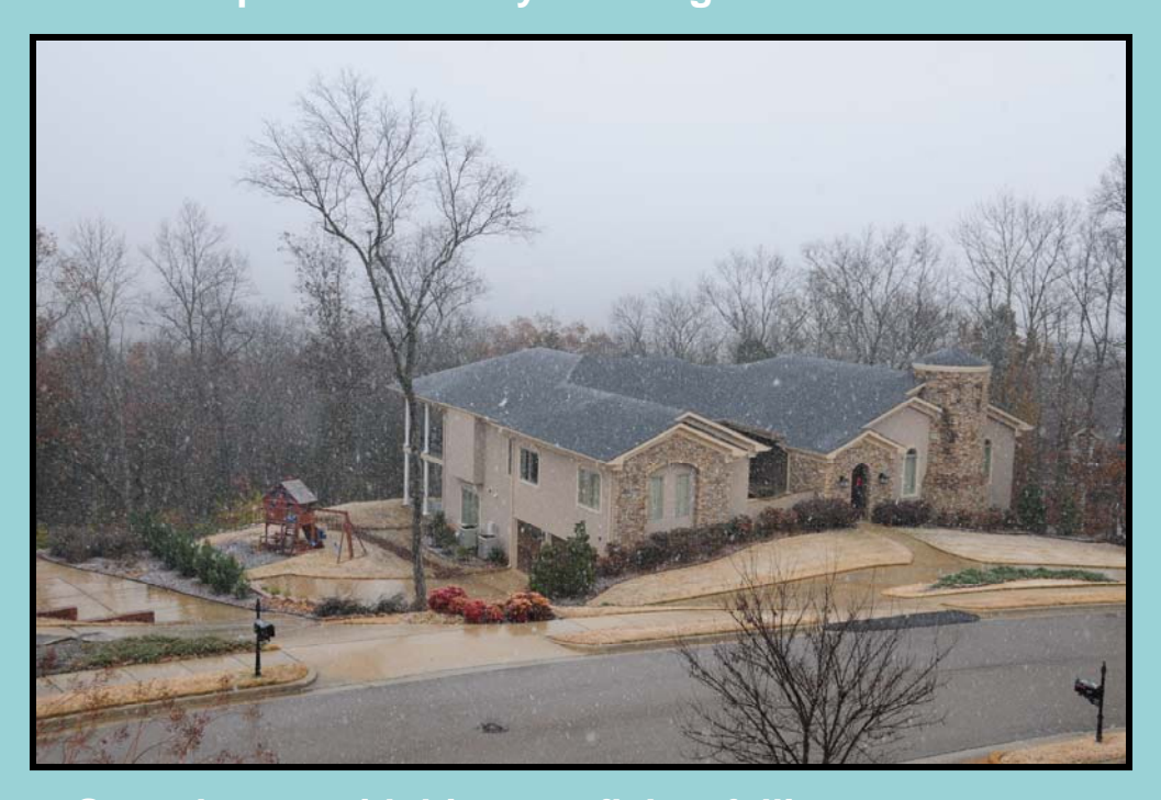
Same house with big snowflakes falling