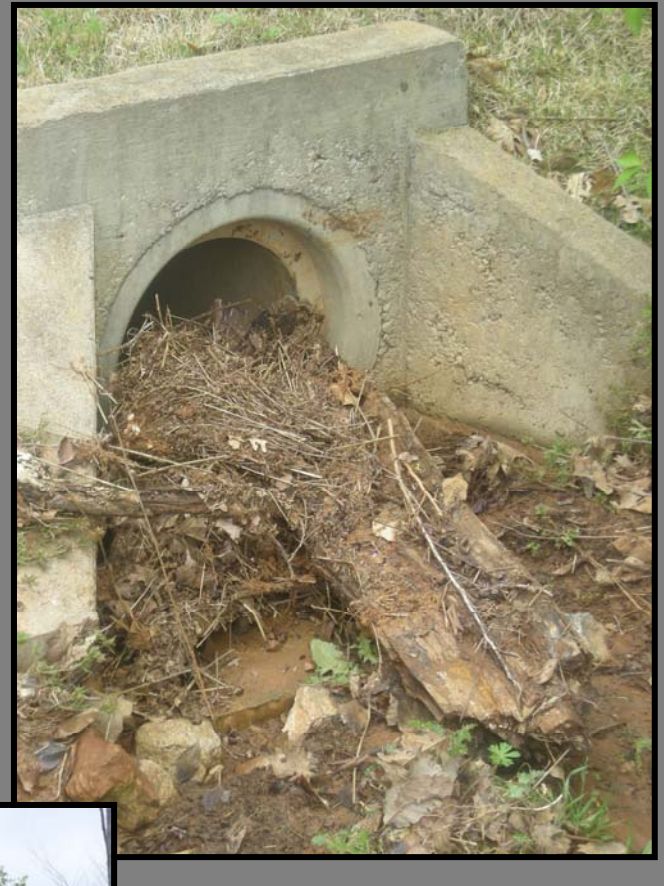
A drain was overwhelmed and plugged