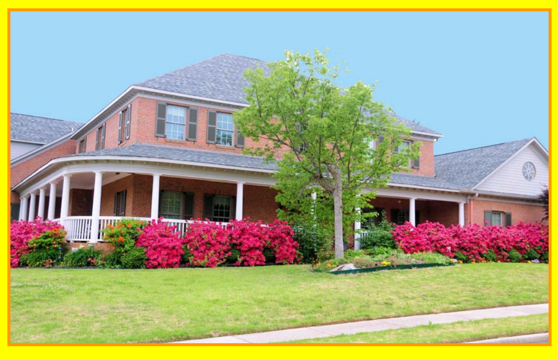
Joyce Neighbors' azaleas are magnificent

Bob and Diane Noel's house is ready for Spring. It is a model for neat and clean landscaping.