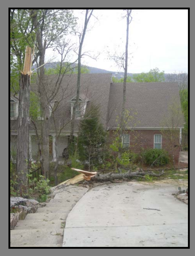
Trees blew down - Brooks' house